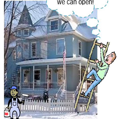
Restoring Hope Transplant House Middleton, WI