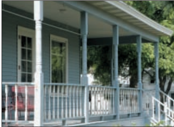
The large front porch is a peaceful place for guests of the House to gather and enjoy conversation and companionship.

The House is designed to offer both private and community space. The facilities will foster and support independence by providing shared kitchen and laundry facilities. Each guest will have a private room and share common areas where they can interact with the other guests.