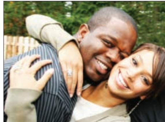
The Restoring Hope Transplant House will provide a home away from home where transplant patients and their caregivers can interact with others or enjoy quiet time alone.

The House is designed to serve adult patients and caregivers only. While we would like to be able to accommodate whole families, infection risk is a concern while patients are healing. As a precaution we can only accommodate family members age 17 and older.